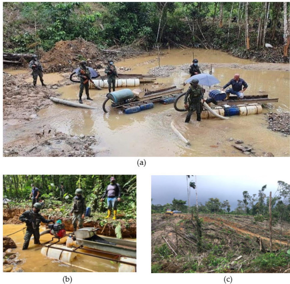
Figure 3. Illegal mining in the northern Amazon region of Ecuador. (a) Armed forces operations against artisanal gold mining in Sucumbíos (Cáscales). (b) Operation and closure of illegal mining in Orellana (Alto Punino). (c) Impacts of illegal gold mining in Napo (Chontapunta).

The harmful effects of Hg in the southern sector of the Amazon as a result of gold mining have intensified since the 1980s, when artisanal gold mining began to develop [13]. Although in this region ASLGM generates important economic values, it also causes various types of contamination [41]. Zamora Chinchipe is the largest generator of gold mining economy. Most of the gold extraction originates from artisanal and small-scale mining [13,41]. The geology of the site, which is rich in polysulfide and metamorphic rocks, may be the reason for the presence of Hg. However, Hg concentrations in the soils of the Yacumbi River exceed normal concentrations. This is due to the constant use of Hg as amalgam in gold mining processes [41]. The environmental changes caused by artisanal gold mining in the Nambija district because of Hg register high contamination by this metal, while soil erosion increases Hg concentrations of sediments in the different aquatic ecosystems of the Nambija stream and river [13,39]. This not only represents a serious risk to the health of the organisms and plants that live in the water, but also represents a threat to the people who use the ecosystem services of the water bodies.